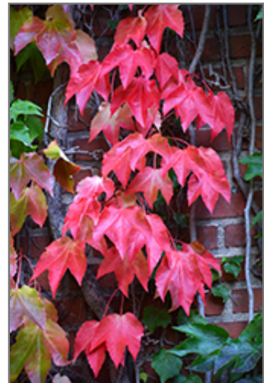
Boston Ivy in fall