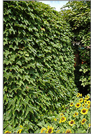
Boston Ivy