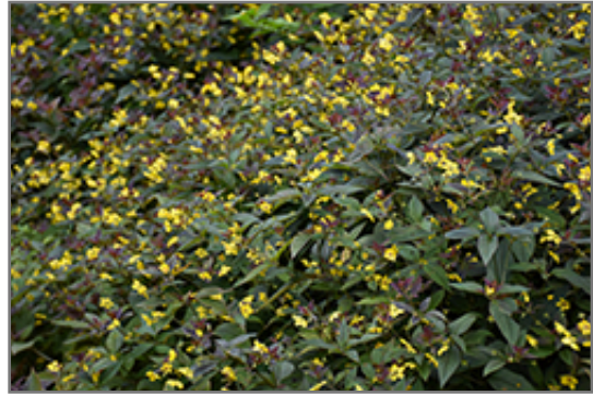
Firecracker Loosestrife in bloom

Firecracker Loosestrife is recommended for the following landscape applications;