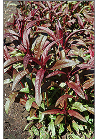
Firecracker Loosestrife foliage