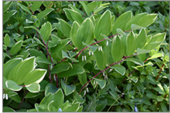
Variegated Solomon's Seal flowers