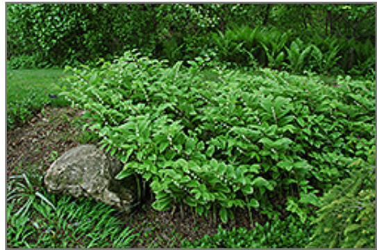
Variegated Solomon's Seal in bloom