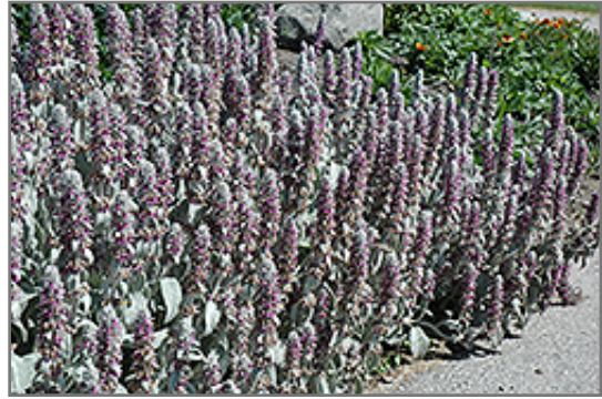
Lamb's Ears in bloom

Lamb's Ears will grow to be about 12 inches tall at maturity extending to 18 inches tall with the flowers, with a spread of 24 inches. When grown in masses or used as a bedding plant, individual plants should be spaced approximately 18 inches apart. Its foliage tends to remain dense right to the ground, not requiring facer plants in front. It grows at a fast rate, and under ideal conditions can be expected to live for approximately 10 years. As an herbaceous perennial, this plant will usually die back to the crown each winter, and will regrow from the base each spring. Be careful not to disturb the crown in late winter when it may not be readily seen!