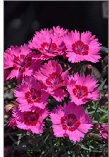
Paint The Town Fancy Pinks flowers