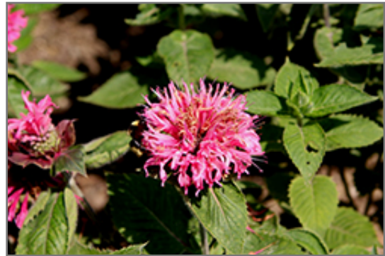
Bee-You Bee-Lieve Beebalm flowers

Bee-You Bee-Lieve Beebalm is recommended for the following landscape applications;