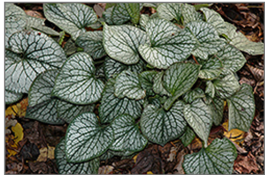
Jack Frost Bugloss foliage