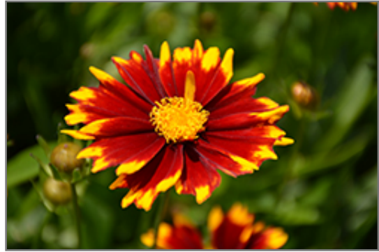
UpTick Red Tickseed flowers

UpTick Red Tickseed will grow to be about 12 inches tall at maturity, with a spread of 14 inches. Its foliage tends to remain dense right to the ground, not requiring facer plants in front. It grows at a medium rate, and under ideal conditions can be expected to live for approximately 10 years. As an herbaceous perennial, this plant will usually die back to the crown each winter, and will regrow from the base each spring. Be careful not to disturb the crown in late winter when it may not be readily seen!