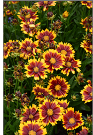
UpTick Red Tickseed flowers

UpTick Red Tickseed is recommended for the following landscape applications;