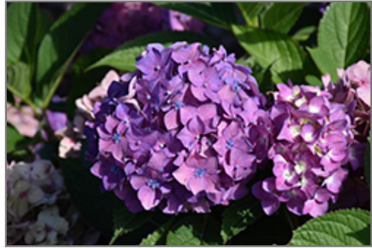
Let's Dance Arriba! Hydrangea flowers