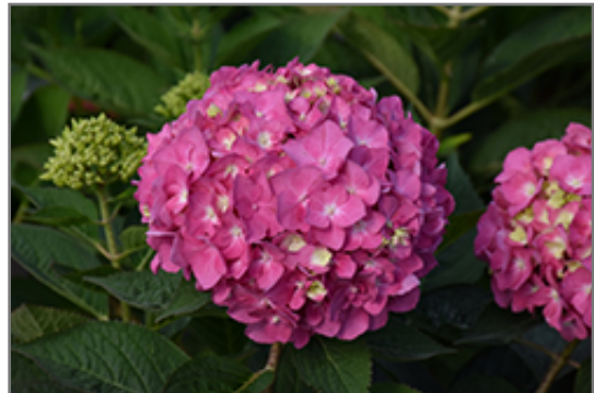
Let's Dance Arriba! Hydrangea flowers

Let's Dance Arriba! Hydrangea is recommended for the following landscape applications;