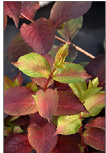
Midnight Sun Reblooming Weigela foliage