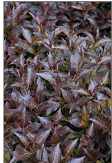
Midnight Wine Shine Weigela foliage