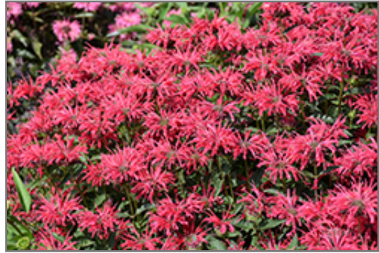
Upscale Red Velvet Beebalm flowers

Upscale Red Velvet Beebalm is an herbaceous perennial with a mounded form. Its medium texture blends into the garden, but can always be balanced by a couple of finer or coarser plants for an effective composition.