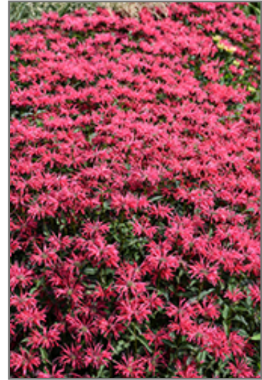
Upscale Red Velvet Beebalm flowers