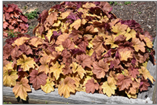
Big Top Caramel Apple Coral Bells

Big Top Caramel Apple Coral Bells is recommended for the following landscape applications;