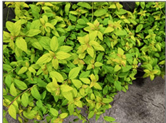
Little Spark Spirea foliage