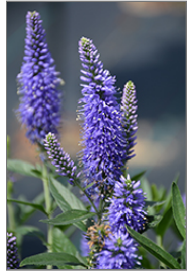
Skyward Blue Long-leaf Speedwell flowers