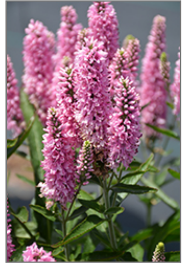
Skyward Pink Long-leaf Speedwell flowers