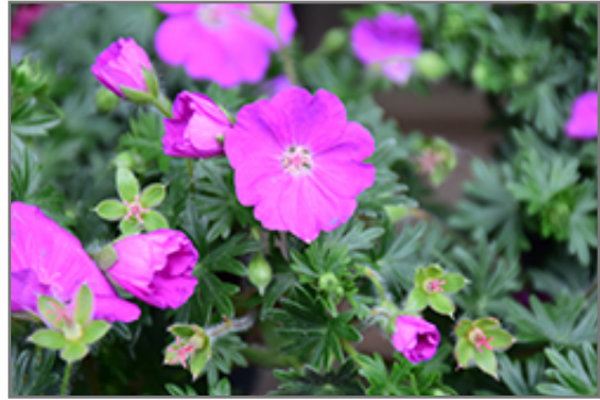
Max Frei Bloody Cranesbill flowers

Max Frei Bloody Cranesbill will grow to be only 6 inches tall at maturity extending to 8 inches tall with the flowers, with a spread of 10 inches. When grown in masses or used as a bedding plant, individual plants should be spaced approximately 10 inches apart. Its foliage tends to remain low and dense right to the ground. It grows at a medium rate, and under ideal conditions can be expected to live for approximately 10 years. As an herbaceous perennial, this plant will usually die back to the crown each winter, and will regrow from the base each spring. Be careful not to disturb the crown in late winter when it may not be readily seen!