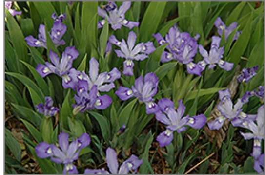
Crested Iris flowers

Crested Iris is recommended for the following landscape applications;