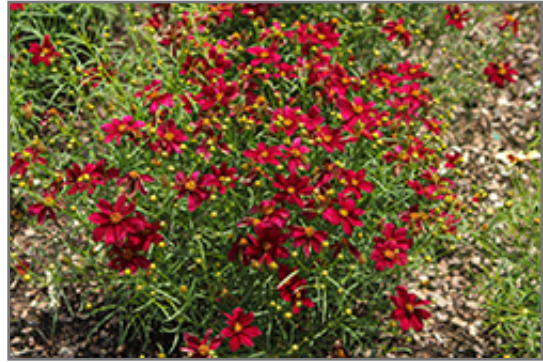
Designer Threads Scarlet Ribbons Tickseed flowers

Designer Threads Scarlet Ribbons Tickseed is recommended for the following landscape applications;