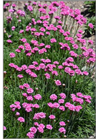
Bloodstone Sea Thrift in bloom