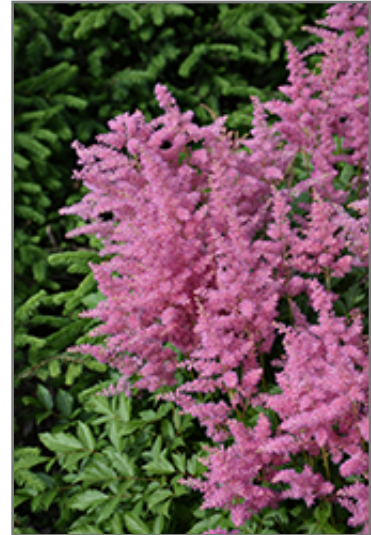
Vision in Pink Astilbe flowers

Vision in Pink Astilbe is recommended for the following landscape applications;