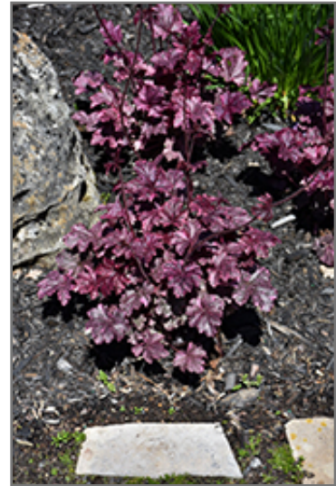
Midnight Rose Coral Bells