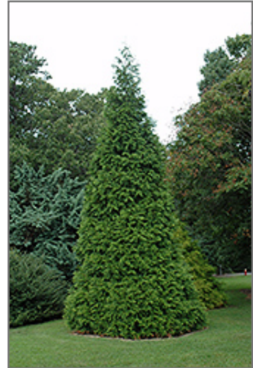
Green Giant Western Arborvitae

Green Giant Western Arborvitae will grow to be about 25 feet tall at maturity, with a spread of 12 feet. It has a low canopy, and should not be planted underneath power lines. It grows at a slow rate, and under ideal conditions can be expected to live for 50 years or more.