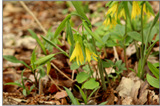
Merrybells flowers

Merrybells is recommended for the following landscape applications;