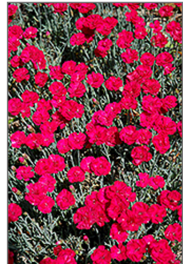
Frosty Fire Pinks flowers