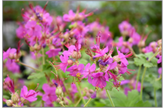
Bevan's Variety Cranesbill flowers

Bevan's Variety Cranesbill is recommended for the following landscape applications;