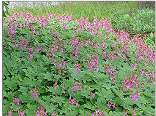
Bevan's Variety Cranesbill in bloom