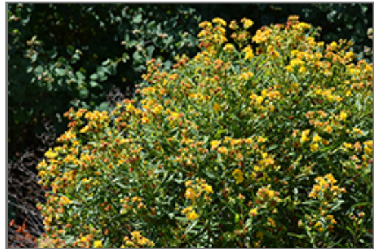
Sunny Boulevard St. John's Wort in bloom