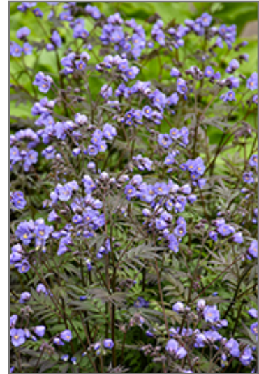
Heaven Scent Jacob's Ladder

Heaven Scent Jacob's Ladder is recommended for the following landscape applications;