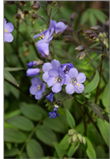
Heaven Scent Jacob's Ladder flowers