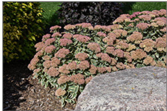
Autumn Charm Stonecrop in bloom