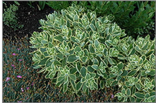
Autumn Charm Stonecrop

Autumn Charm Stonecrop will grow to be about 18 inches tall at maturity, with a spread of 18 inches. It grows at a fast rate, and under ideal conditions can be expected to live for approximately 15 years. As an herbaceous perennial, this plant will usually die back to the crown each winter, and will regrow from the base each spring. Be careful not to disturb the crown in late winter when it may not be readily seen!