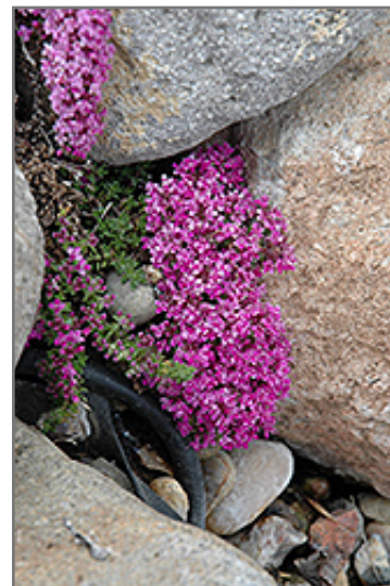
Pink Chintz Thyme in bloom