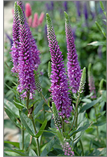
Purpleicious Speedwell flowers

Purpleicious Speedwell is recommended for the following landscape applications;