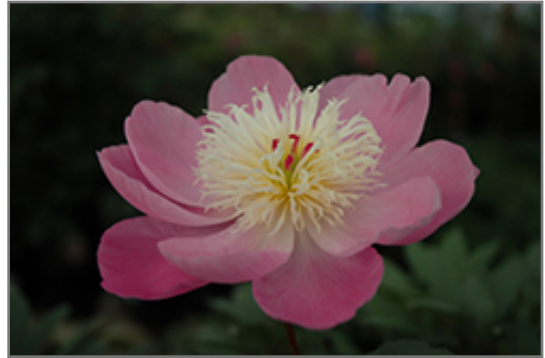
Edulis Superba Peony flowers